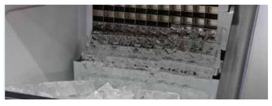
CARLO GAVAZZI Automation Components. Specifications are subject to change without notice. Illustrations are for example only.

Capacitive sensors also enable accurate control of water levels by sending a water-fill signal to the controller. RSWT and RSGD soft starters are also used to soft start and soft stop high pressure pumps in industrial washing equipment.