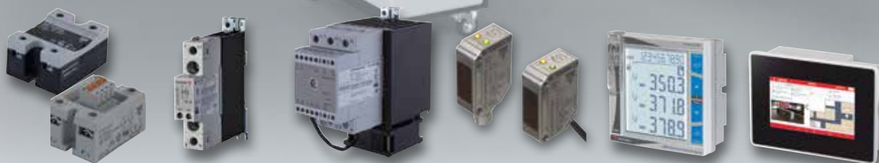
Solid state switches