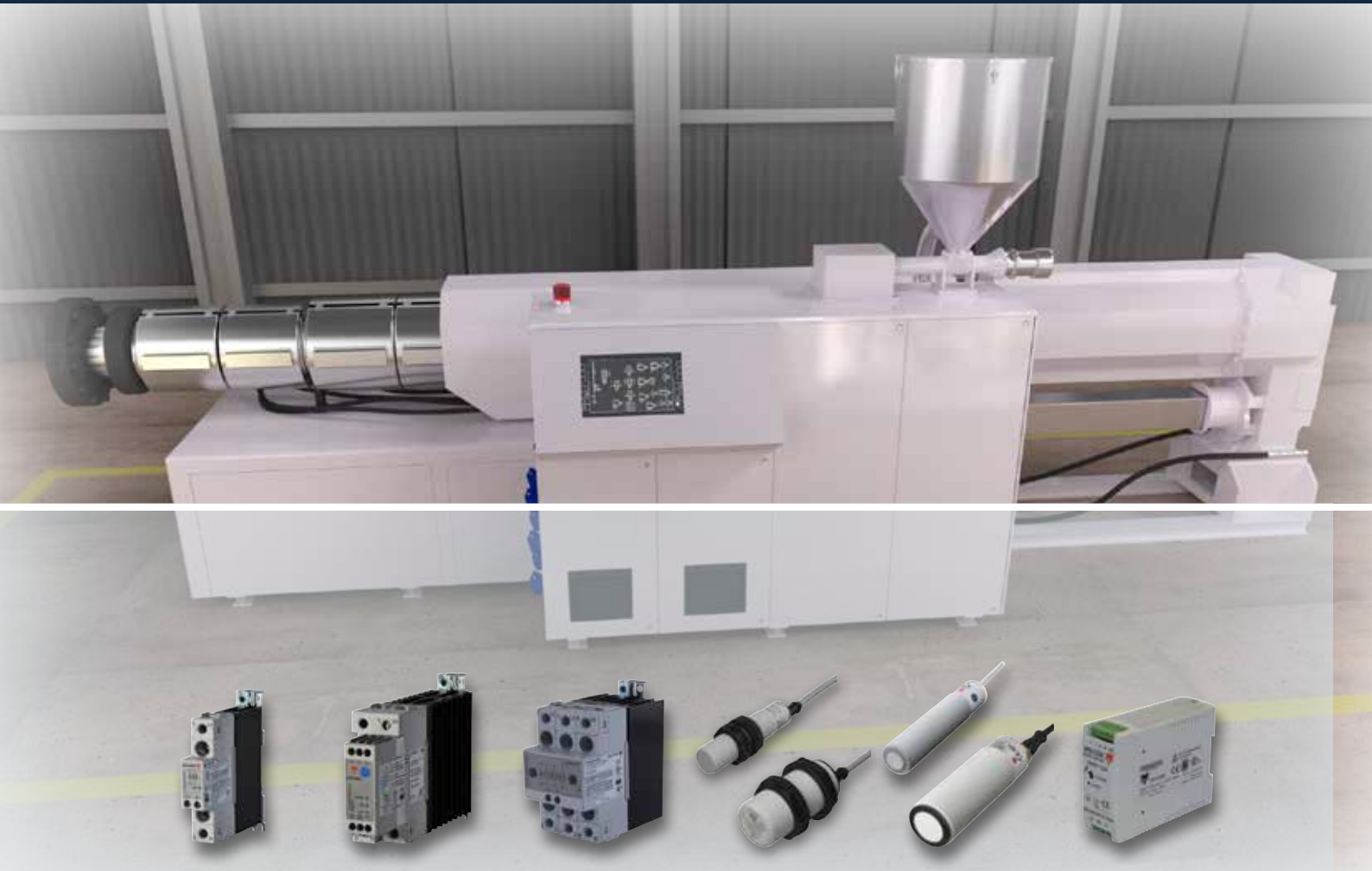
Solid state switches